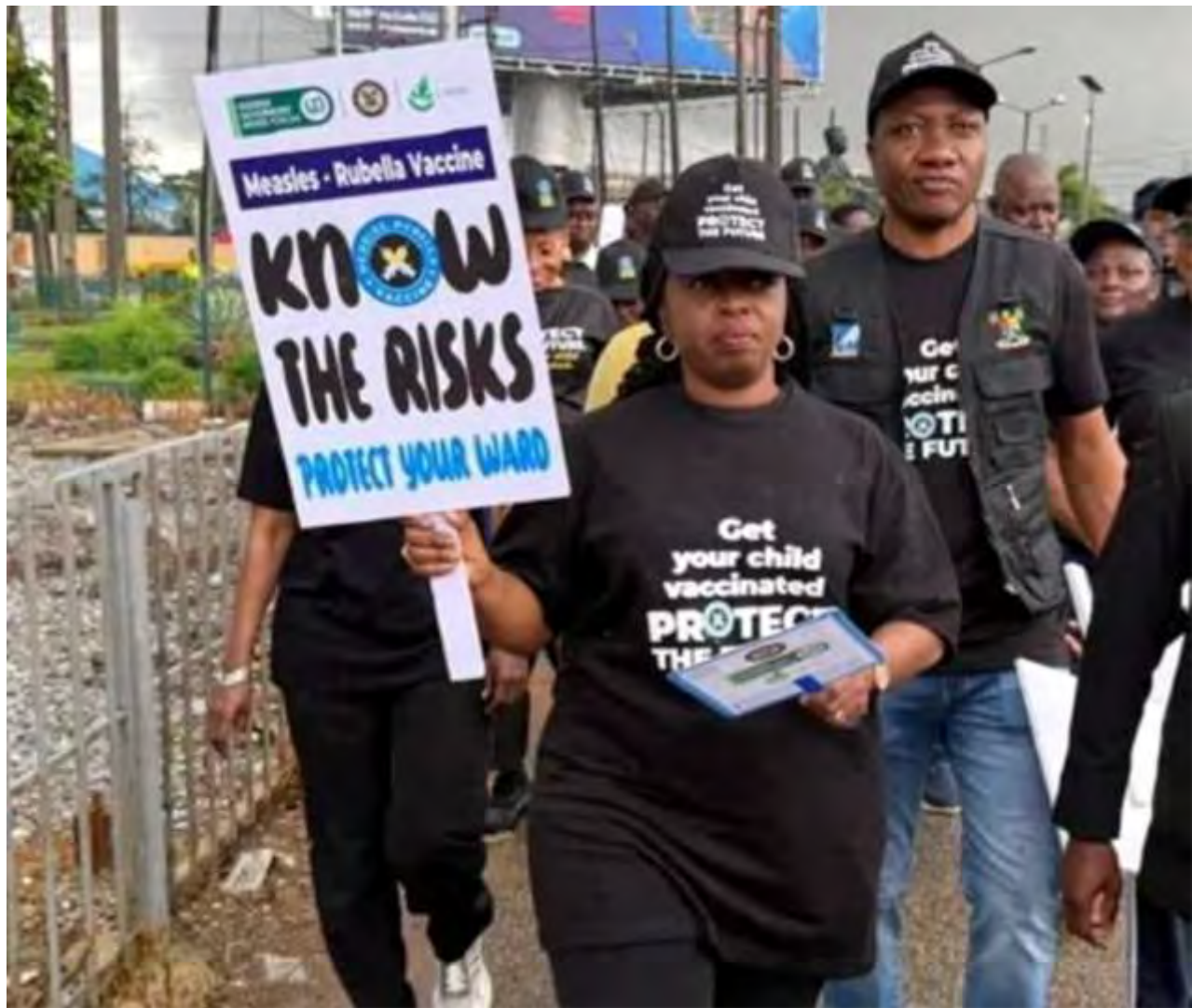
First Lady of Lagos, Doc. Ibijoke Sanwo-Olu holding a placard during the campaign